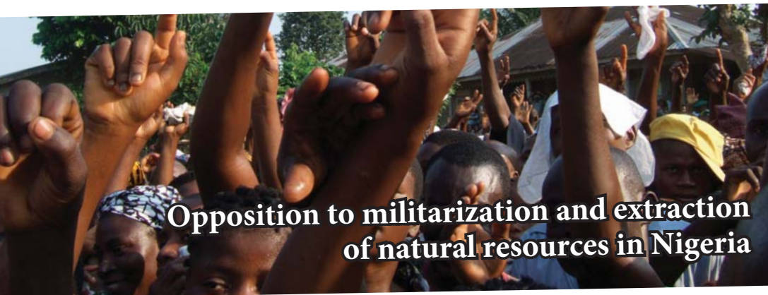
Opposition to militarization and extraction of natural resources in Nigeria