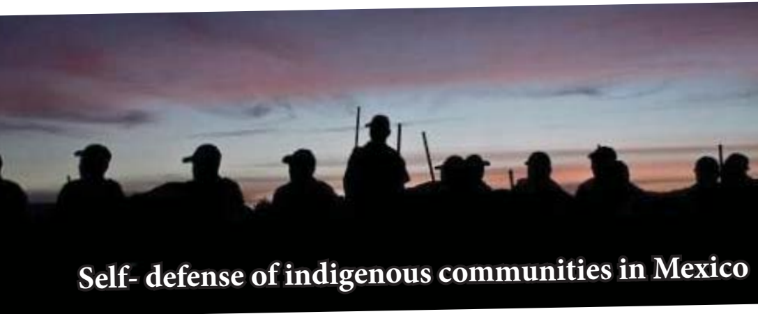
Self- defense of indigenous communities in Mexico