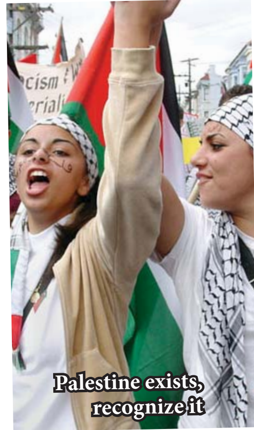
Palestine exists, recognize it