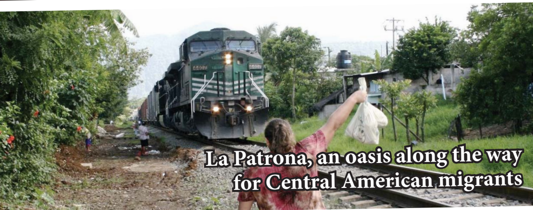
La Patrona, an oasis along the way for Central American migrants